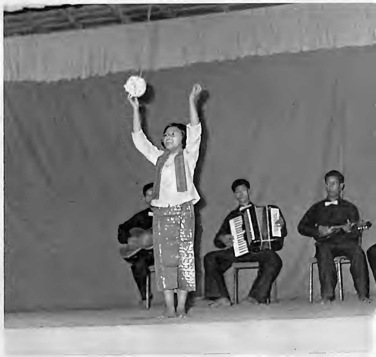
Solo: Long Live the Samdech, Head of State and Chairman of the United Front! , a song specially composed for the Samdech's return to his country.